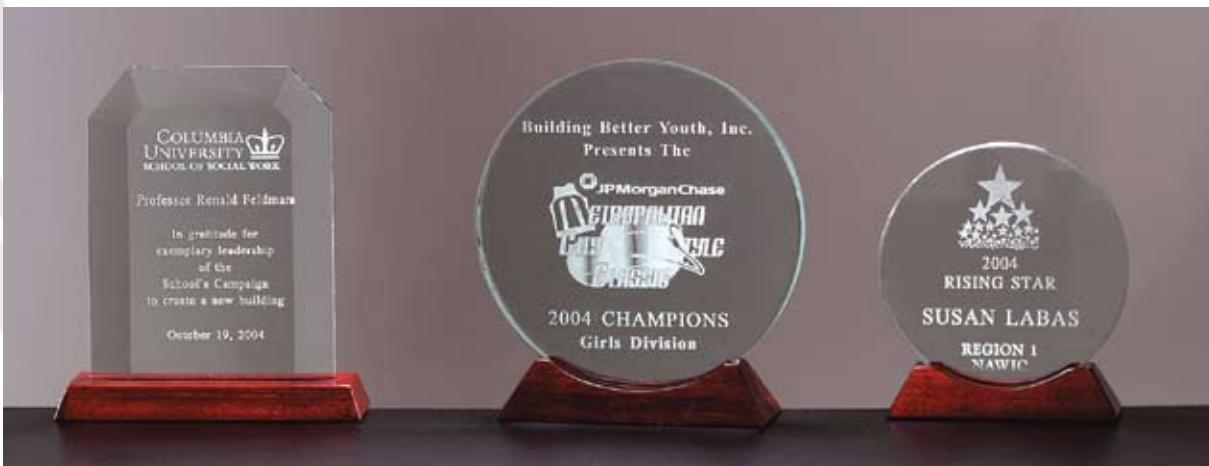
JG 155 Beveled Arch Award 8" x 7 1/2", 3/4" thick Engraveable area: 3 1/2" x 5 1/2" Ht. 7 1/2" High Gloss Wood base