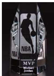
CR 182 Optical Cut Crystal Pillar Ht. 5" x 3"; 2 1/2" depth. Engraveable area: 1 1/4", Ht. 4"