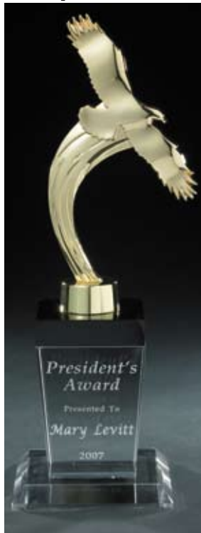
CR 211 , Gift Boxed 13" Gold Eagle on Optical Cut Crystal Base. Engraving area 4" x 2 1/2"