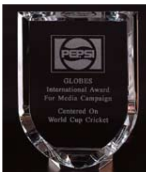
CR 180 Optical Cut Crystal Shield Ht. 5 1/2" x 4 1/4", 1/2" thick Engraveable area: 3", Ht. 3 1/2"