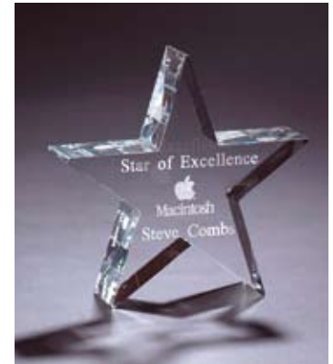
CR 206 5" Star Optical Crystal Engraveable area: center 2 1/2", bottom 1 1/2"