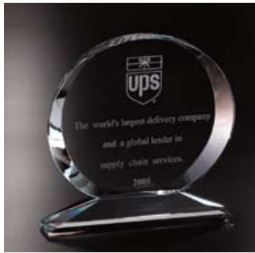
CR 208 Optical Cut Crystal Ht. 7 1/4" x 7 3/4" width. Engraveable area top 4", center 5 3/4", bottom 2 1/2"