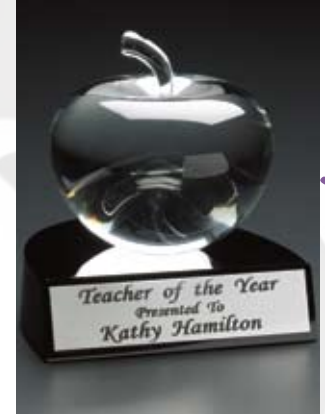
CR 219 Apple 4" x 4 1/2", Engraveable area: 4" x 7/8"