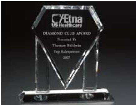
CR 234 8" x 8"