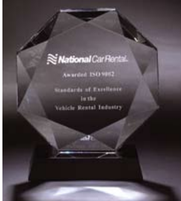
CR 139 Optical Cut Octagon Ht. 8 3/4" x 8", 1 1/4" thick, Engraveable area: 5" x 5"