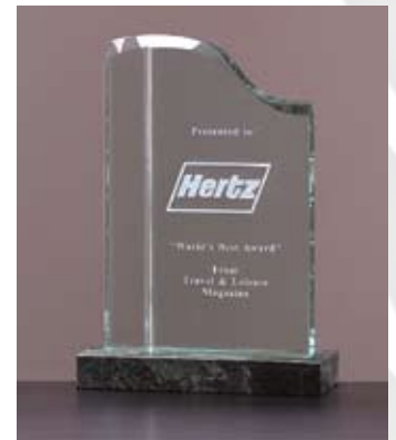
CR 200 Optical Crystal Ht. 8 1/2"

6 1/2" Ht. x 5 1/2", 5/16" thick Engraveable area: 3 1/4" x 4" Ht.