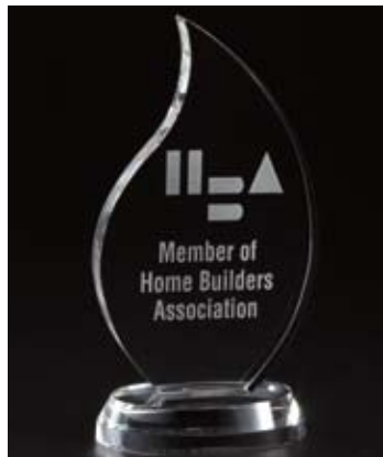
Flame Award Customized to order CR 223 4" x 7 1/2"