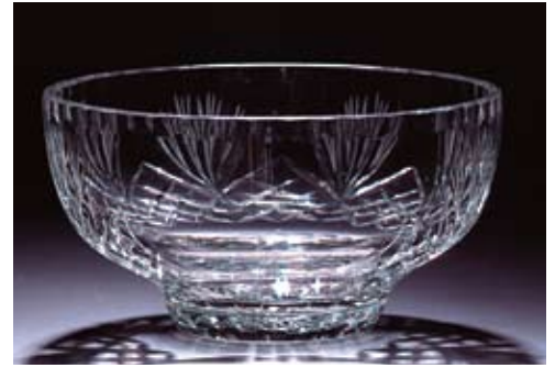
CR 124 8" Dia. Crystal Bowl, Ht. 4 1/8"