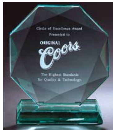
JG165 Octagon Award 8" Ht. x 7" x 3/4" thick Engraveable area: top 3", Ctr. 4 1/2", bottom 3", Ht. 4"