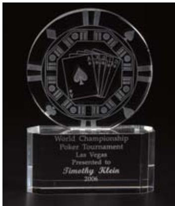
Poker Award Sandblasted Image CR 215 5 1/2" x 8"