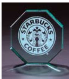
JG158 Glass Octagon Paperweight 3 1/2" x 3 1/2" x 3/4" thick Engraveable area: 2 1/2" x 2 1/2"