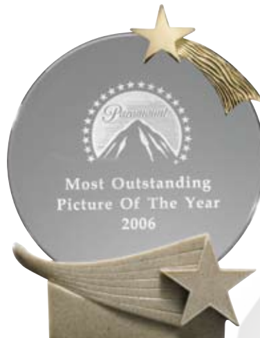
9" TR 5574 Black Stone