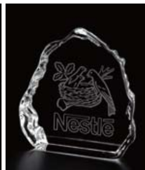
Iceberg Award Customized to order CR 230 5"