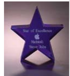
CR 196 4" Blue Star Paperweight