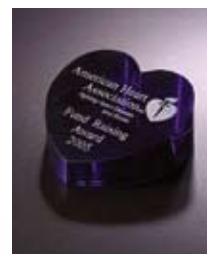
CR 199 3" Blue Heart Paperweight