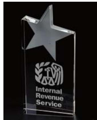
CR 232 3" x 6 3/4"