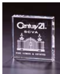
CR 194 3" x 3" Optical Crystal, 3/4" thick Paperweight Engraveable area: 2 1/2" x 2 1/2"