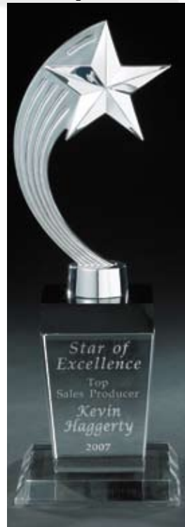
CR 214 , Gift Boxed 13" Silver Star on Optical Cut Crystal Base. Engraving area 4" x 2 1/2"