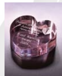
CR 198 3" Pink Heart Paperweight