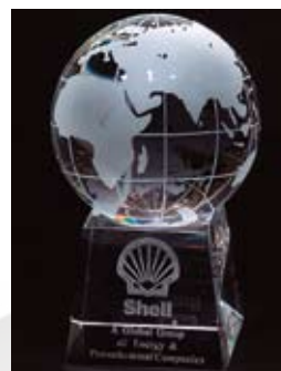
CR 136 Optical Crystal Globe Ht. 6"; 4" Etched, Base Ht. 2" x 3" x 3" Engraveable area: 2" Ht. x 1 1/2"