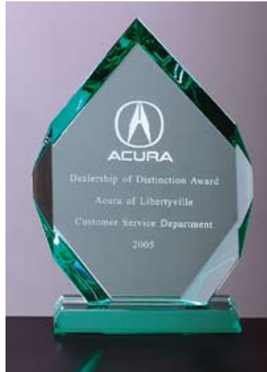
JG161 Arrowhead Award 10 1/2" Ht. x 7 1/2" x 3/4" thick Engraveable area: top 2", Ctr. 5", bottom 2 1/2", Ht. 6"