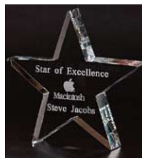
CR 210 Optical Cut Crystal 4" Star Engraveable area: 1 1/2" Ht. 3" width, bottom 2"