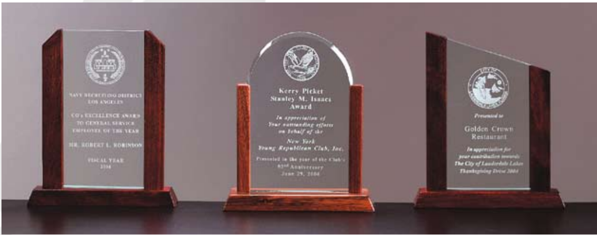
JG 172 Beveled Arch Award 9" Ht. x 7 1/2", 5/16" thick Piano Finish Rosewood base Engraveable area: 3 1/2" x 7" Ht.

All items are delivered gift boxed. They can be Laser engraved.