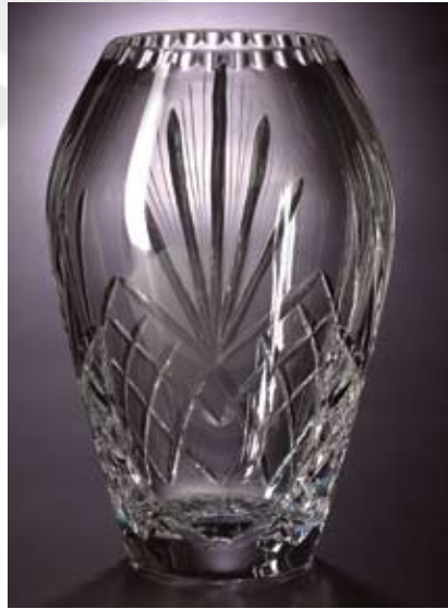
CR 130 10" Crystal Vase