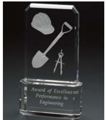
Construction Award Sandblasted Image CR 225 4" x 7"