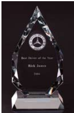
CR 179 Optical Cut Diamond Crystal Ht. 8" x 4", 3/4" thick, Engraveable area: 2 1/2", Ht. 4"