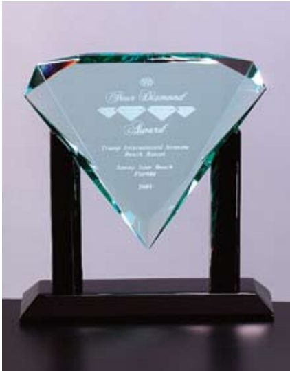
JG162 Diamond Award 9" Ht. x 8 1/2" x 3/4" thick Piano Finish Black Base Engraveable area: top 5 1/2", bottom 1 1/2", Ht. 3 1/2"