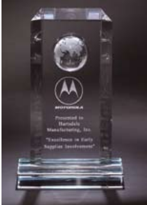
CR 207 Optical Cut Crystal, Bas relief Globe. Ht. 9". Engraveable area: 4 1/2" Ht. x 2 3/4"