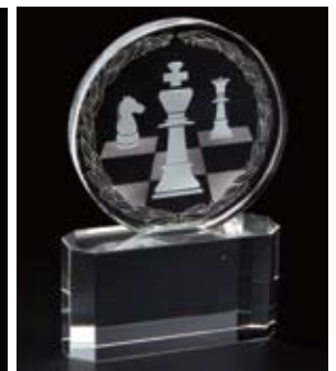
Chees Award Sandblasted Image CR 231 6", 4" Circle