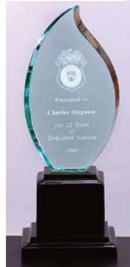
JG 163 Glass Flame Award 11 3/4" Ht. x 4" x 3/4" thick Piano Finish Black Wood Base Engraveable area: top 1 1/2", Ctr. 3", bottom 1 1/2", Ht. 5"