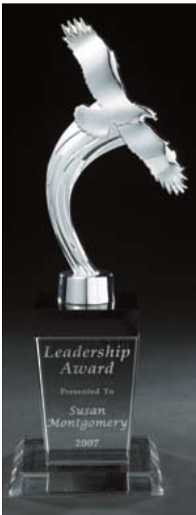
CR 212 , Gift Boxed 13" Silver Eagle on Optical Cut Crystal Base. Engraving area 4" x 2 1/2"