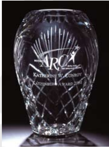
CR 128 8" Crystal Vase

The Vases and Bowl in the top row are hand cut Lead Crystal. They have to be engraved by Sandblasting. All others are Optical Crystal which can be Laser engraved. Lead Free.