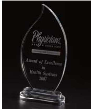
Flame Award Customized to order CR 222 5" x 10 3/4"