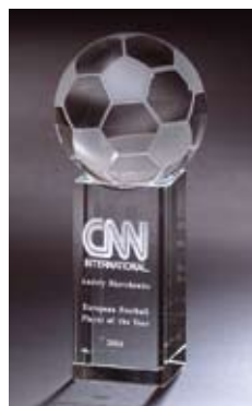
CR 137 Optical Crystal Soccer Ball, Ht. 7"; 2 7/8" Etched, Base Ht. 4" x 2" x 2", Engraveable area: 1 1/2", Ht. 3 1/2"