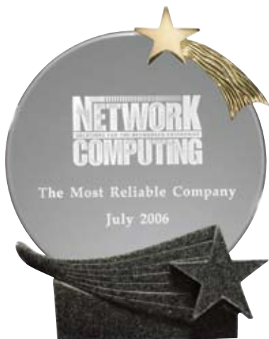
9" TR 5573 Black Stone