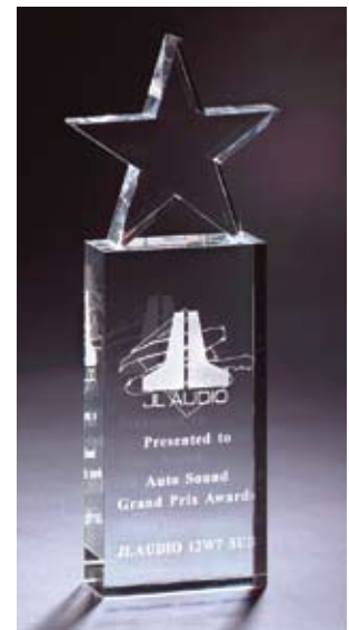
CR 138 10 1/4" Ht. x 4", 1 1/4" thick Optical Cut Star Engraveable area: 2 1/2", Ht. 5 1/2"