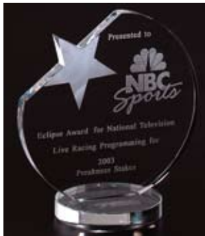
CR 185 Optical Cut Round Crystal w/ Star Ht. 6" x 5 1/2", 1/2" thick, Engraveable area: 4" x 4"