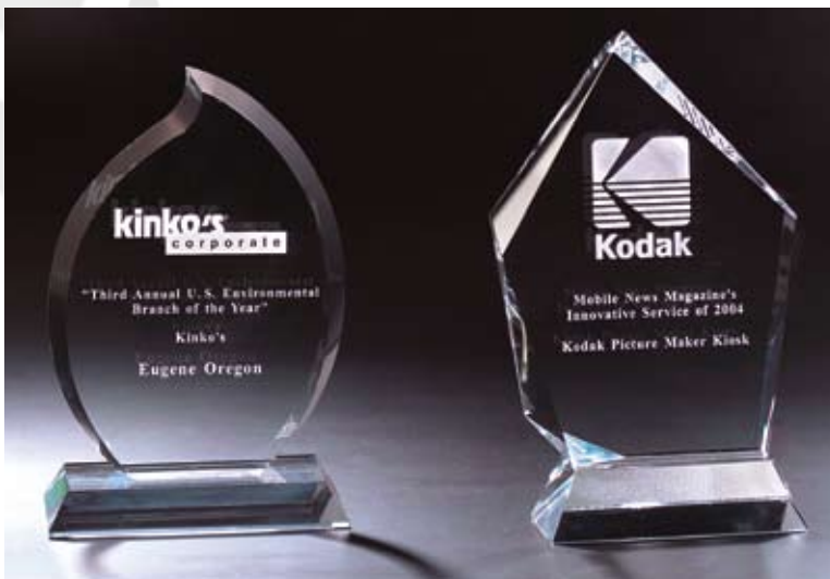
CR 178 8 1/2" Ht. x 5 1/2", 3/4" thick Optical Cut Flame Crystal Engraveable Area: 3"x Ht. 5"