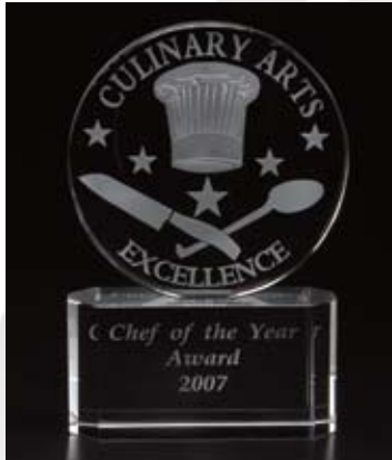
CR 221 5" x 8" Culinary Arts Award Deeply Sandblasted Image

All Crystal Awards are delivered in Deluxe gift boxes. The Crystal pieces can be Laser engraved. They are Lead free. Where feasible engraving plates can be applied. Engraving on plates additional costs per letter, additional when letters are oxidized. Laser engraving Crystal see page