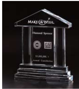
CR 209 Optical Cut Crystal Ht. 7" Engraveable area Roof 3 1/2", House 2 1/4" x 3 1/2" width.