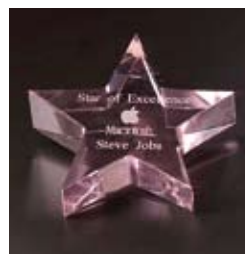
CR 197 4" Pink Star Paperweight