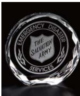
Diamond Facetted Award Customized to order CR 229 3 3/4" Circle