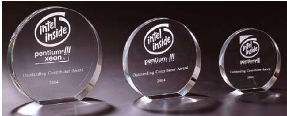
CR 202 6" Optical Crystal Engraveable area: top 3", center 5", bottom 3"