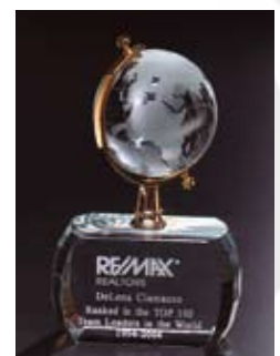
CR 195 5 1/2" Optical Crystal, 2 1/4" Etched Spinning Globe, Base 2" Ht. x 2 1/2", 2" thick Engraveable area: 2 1/2", Ht. 1 5/8"