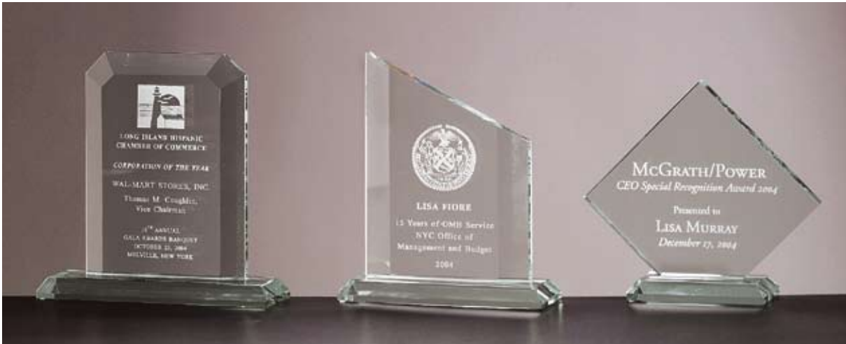
JG 152 Beveled Arch Award 9" Ht. x 8 3/4", 3/4" thick Engraveable area: 3 1/2" x 6" Ht.