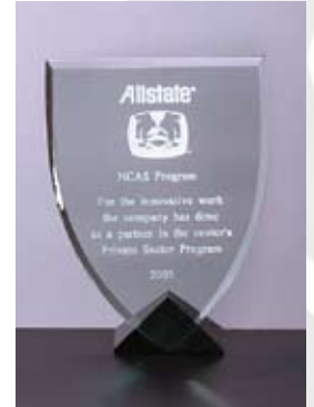
JG168 Glass Shield Award 6 3/8" x 5", 1/2" thick Engraveable area: top 3 1/2", bottom 3", Ht. 4"