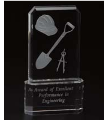
Customized Award Sandblasted Image CR 224 5 3/4" x 8 1/2"