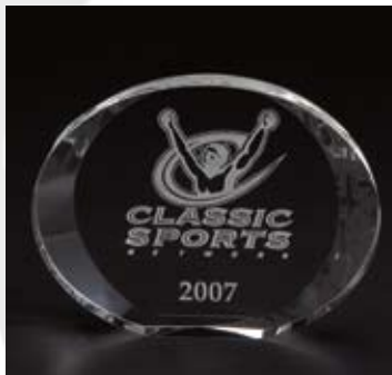
General Award Customized to order CR 226 7" x 5 1/2"