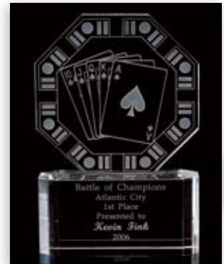
CR 217 6" x 4" Optical Crystal Poker Trophy Deep Etched Sandblasted Image