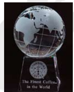
CR 151 Optical Crystal Globe Ht. 5"; 2 3/4" Etched, Base 2 1/4" x 2 1/4" x 2" Engraveable area: 1 1/2" x 1 1/2"