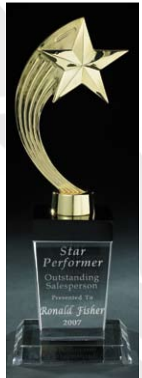
CR 213 , Gift Boxed 13" Gold Star on Optical Cut Crystal Base. Engraving area 4" x 2 1/2"