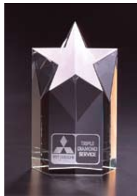
CR 205 6" Star Optical Crystal Engraveable area: 1 3/4" x 1 3/4"