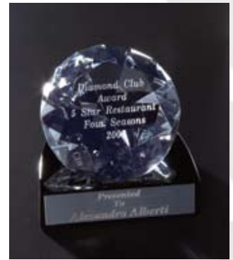
CR 220 Diamond Club Ht. 4 1/4" x 4", Engraveable area: 2 1/2" octagon 4" x 7/8" plate