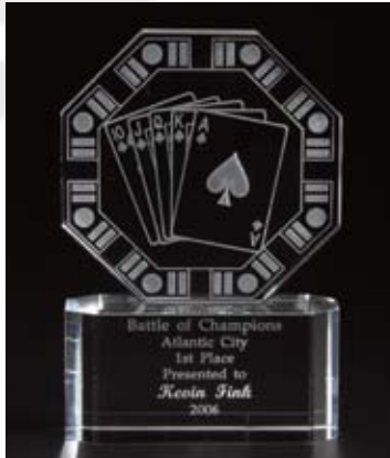
Poker Award Sandblasted Image CR 216 5" x 8" CR 217 4" x 6"