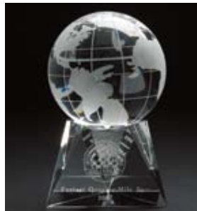
CR 235 Globe 4 1/2"