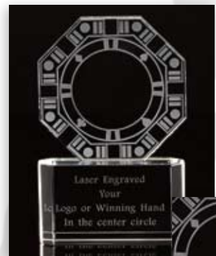
CR 218 6" x 4" Optical Crystal Deep Etched Sandblasted Image