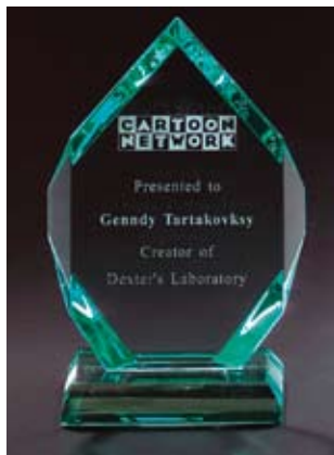
JG164 Arrowhead Award 7 1/2" Ht. x 5 1/4" x 3/4" thick Engraveable area: top 1", Ctr. 3 1/2", bottom 2", Ht. 4"